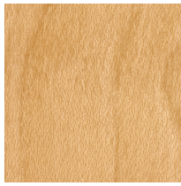
Golden Maple ◇