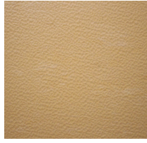
Dark Maple DZ473