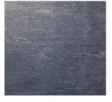
Marine Blue DZ030